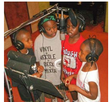
Students record their original songs at Philadelphia International Records in August